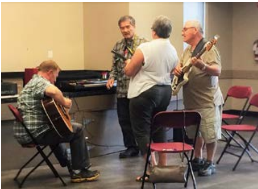
SWESA's Jam Session in Action.

Right now the group includes individuals with keyboards, bass guitars, guitars, and vocals. Strangers are getting to know each other while armed with instruments, and members are dropping in just to listen. The universal language of music has made this group a warm, friendly and ambitious place to harmonize, and the group now welcomes all instruments and singers alike. Come join the fun and be inspired.